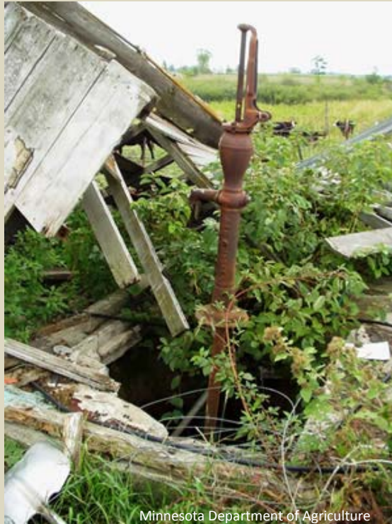
Minnesota Department of Agriculture

Unsealed wells can cause contamination of the groundwater supply, from which we all drink.